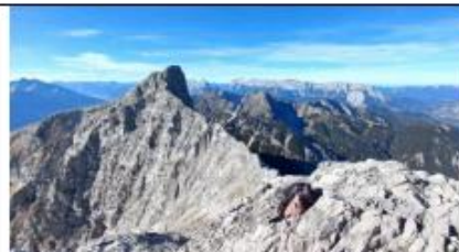
...the summit Hohe Warte